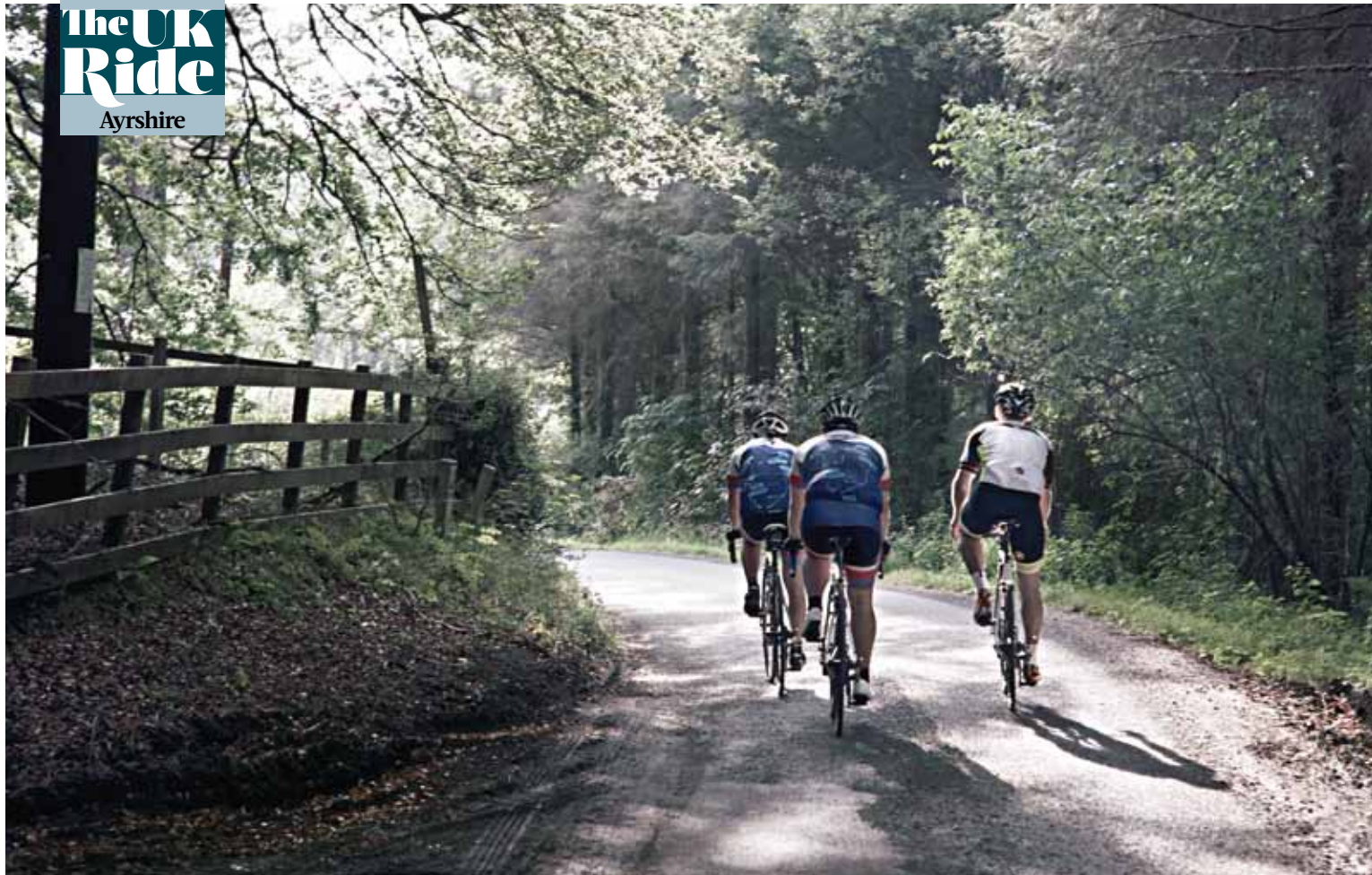
As the sun sinks, the riders know food and some well-earned rest isn't far away